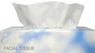
Facial Tissue #51152, 2 ply, 100/box.....$1.45