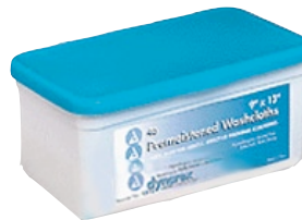
Unscented Adult Wipes #1314, 9" x 13", 46/tub.....$3.95