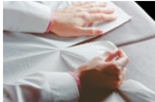
Table Paper #051162, smooth, 21" x 225'.....$3.75