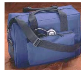
Nurse Medical Bag A heavy duty, padded medical nylon bag to protect your most valuable medical equipment. Color: Navy. #1024, 13 1/2" x 9" x 5 1/2".....$39.95