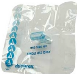
CPR Face Mask with One-Way Valve #10457.....$3.45