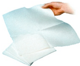
Disposable Wash Cloth #51185, 10" x 14" 500/case.....$33.95