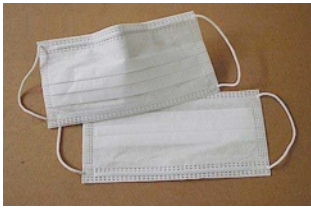
Face Mask #2201, 50/box.....$5.95