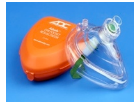
CPR Pocket Resuscitator #4053.....$9.95