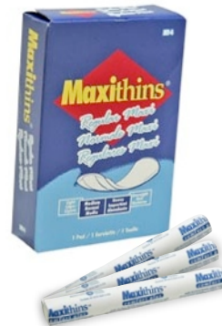
Maxithins Sanitary Napkins Fits in vending units or can be used alone. #N1025, 25/box.....$9.95