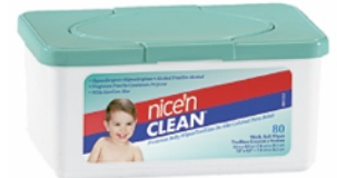
Unscented Baby Wipes (Nice'n Clean®) #A132EO, 80/tub.....$4.35