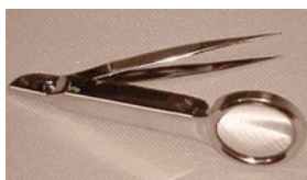
Tweezer with Magnifier #01-074, 3 1/2" stainless steel.....$7.95